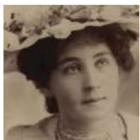
Photo restoration. In 2012 we are introducing a short course on photo restoration, covering scanning and the image editing and repair techniques which can make Aunt Min young again and show how the family really looked 75 years ago.

Discover the full potential of your camera. Our short practical workshops help you understand your camera and capture the images you want. This may mean exploring all the settings, understanding lighting, using flash to best effect and working on specific projects such as landscapes and flowers, portraits or action. The workshops concentrate on practical use of your camera to help you overcome common problems. AND... it's all about working with and enjoying all the images you can create with your camera.